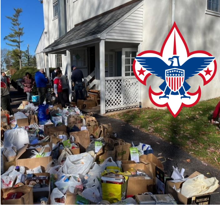
Scout Troop #119 Annual Food Drive