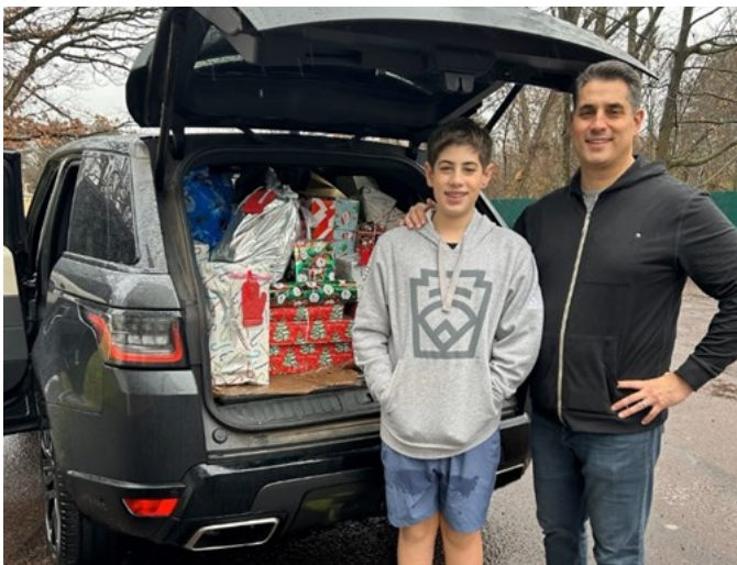
Cassel Mill residents deliver Mitten Tree gifts to Outreach House