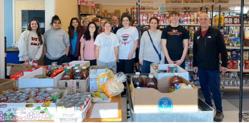
Girl Scout Troop #4373 helped organize food at OH following the Boy Scout Food Drive