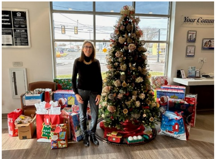
Phoenixville Federal Bank lobby with collected gifts