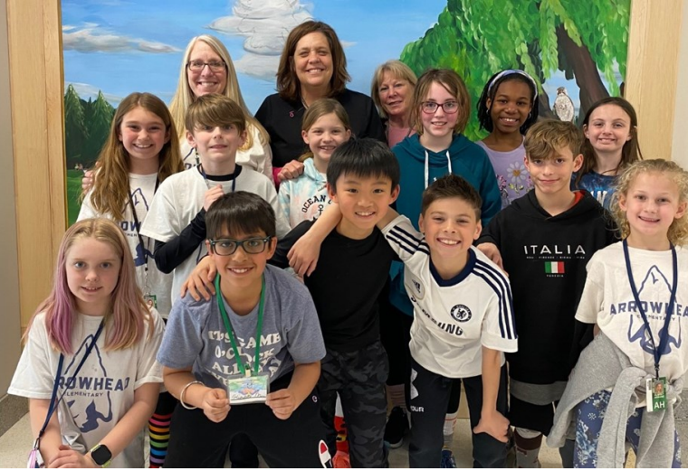
Arrowhead Elementary School Student Council made a cash donation that allowed Outreach House to purchase needed supplies!