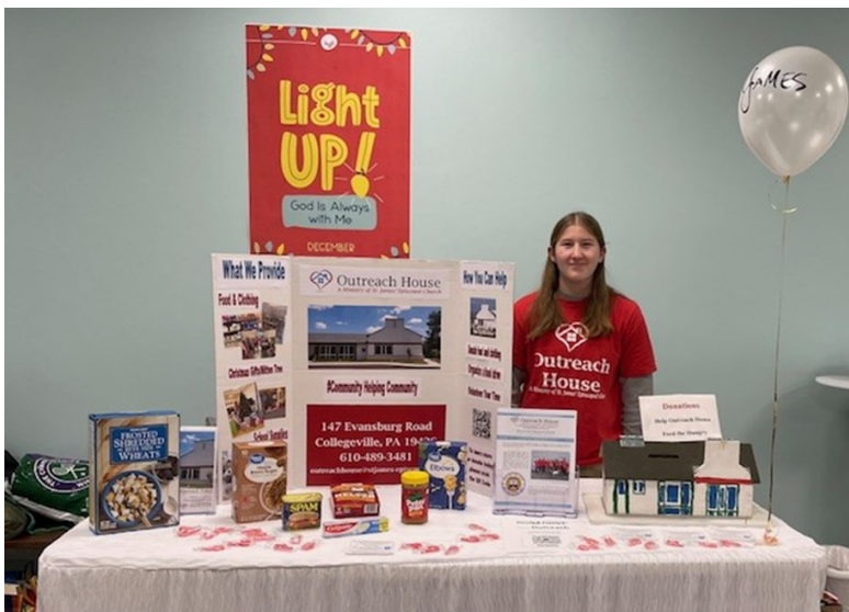
OH display table Next Community Church giving Saturday